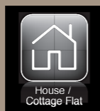
House / Cottage Flat