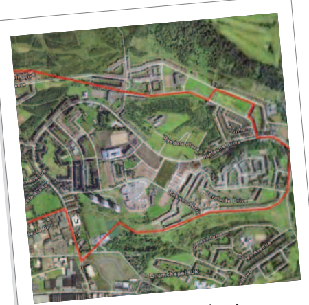
The Drumchapel Study Area

Looking further ahead, we plan to contact you and other local people again every 2 years until 2016. We would like to use this opportunity to ask you how your community has been changing over the years and if these changes have made a difference to your health and wellbeing. This is important because the key purpose of the GoWell study is to try to find out what you think of efforts to improve and regenerate your community and whether these have had an effect on your health and wellbeing.