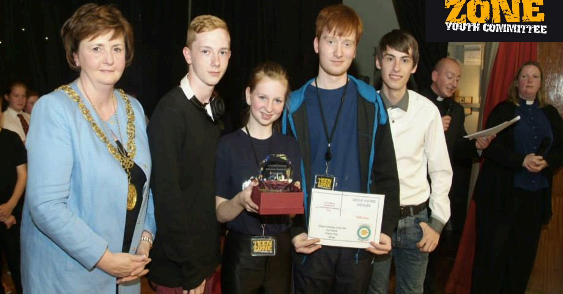
Winners of the Group Category Castlemilk Community Achievement Awards 2013