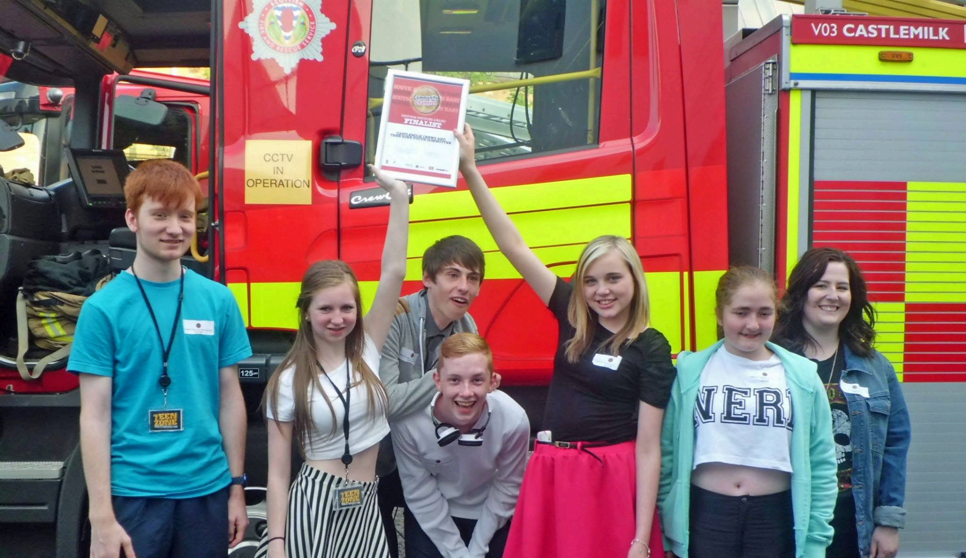
Finalists at the Evening Times Community Championship Awards for the South East Area - 2013